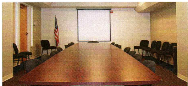
ZANE GREY CONFERENCE ROOM