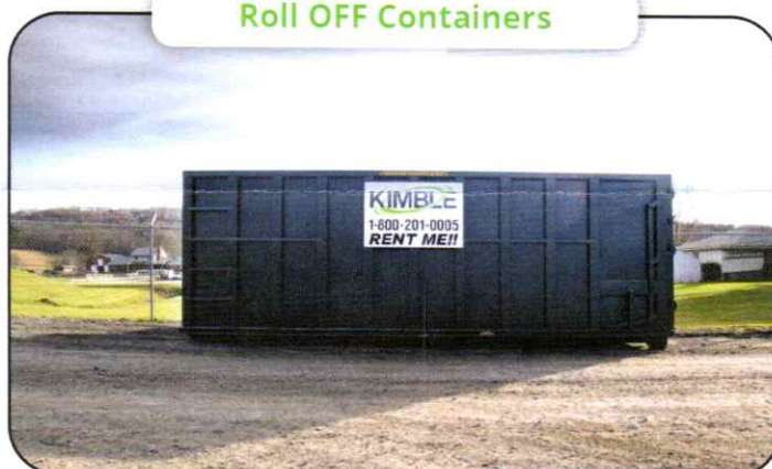
Roll OFF Containers

12 cubic yards, 20 cubic yards, 30 cubic yards and 40 cubic yards are available.