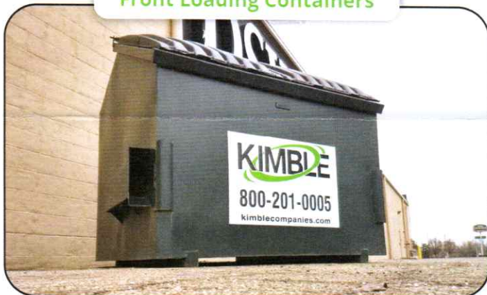
Front Loading Containers

2 cubic yards, 3 cubic yards, 4 cubic yards, and 8 cubic yards are available.